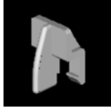
1.B7914451 (x2) GUIDE - LEFT AND RIGHT