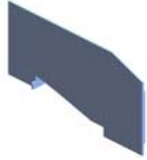
2.B7914458 COVER - SHIFT TRAY